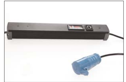
■ In-Line Ammeter