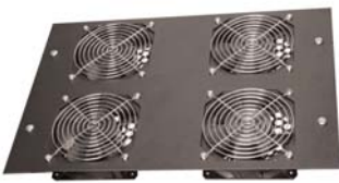
Fi four way roof mount fan tray