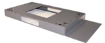
Plinth with fixed stabilising plate