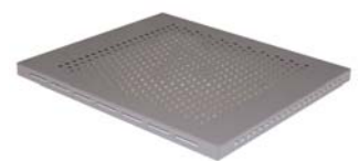
Fi fixed Vented shelf