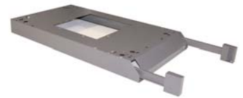
Plinth with stabilising arms