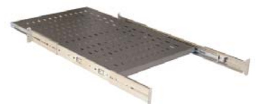
Fi vented telescopic shelf