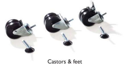
Castors & feet

* See Accessories spec sheet for more details