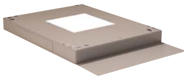
Plinth with fixed stabilising plate