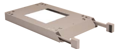
Plinth with stabilising arms