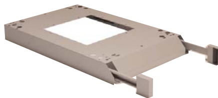
Plinth with stabilising arms