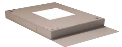
Plinth with fixed stabilising plate