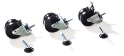
Castors & feet

* See Accessories spec sheet for more details